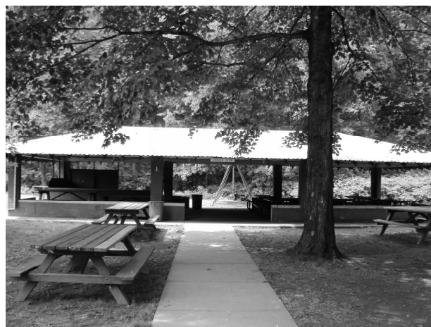
Photo I.D. will be required for all renters of the pavilion! Please contact the Borough office for more information at 724-693-9740 or ahlborn@oakdaleborough.com .