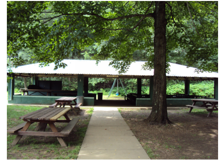
Photo ID will be required for all Renters! Please contact the Borough Office for additional information (724-693-9740 or franchek@oakdaleborough.com ).