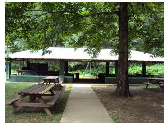
Photo ID will be required for all Renters! Please contact the Borough Office for additional information.